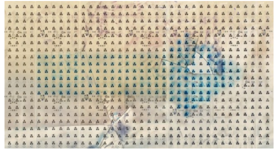
Shannon Ebner, Traffic Control Device , 2014.

Two large photographs in Shannon Ebner's deceptively formal exhibition at Altman Siegel through November 1 depict illuminated road signs. It's a familiar mechanism, which is usually parked on the side of the road—a matrix of bulbs that spell out phrases such as "Expect Delays," which is the text in Ebner's Portable Changeable Message Sign One Delays, 2014. Here, however, while the warning is the same, the form is visually tweaked, and fixed in a moment. The text is seen in negative, the words formed by black dots, which communicate a starker, more embodied emphasis than in its usual illuminated form. In the title, Ebner refers to the machine itself, and its portable, changeable condition. These signs are also termed "variablemessage" a perfectly apt way to describe Ebner's sly, slow burn aesthetic.